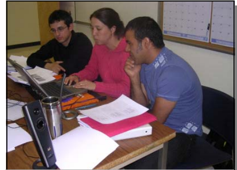
CEMELA Fellows at the University of Arizona use internet technology to work with their research partners at the University of New Mexico.

Year two has been a time of unification and moving forward as a center. Keep an eye out for CEMELA results — we are beginning to present and publish CEMELA findings, always with a focus on connecting culture, language, and mathematics. We will share what we are learning with the goal of positively impacting the teaching and learning of mathematics with Latino students, now and for years to come.