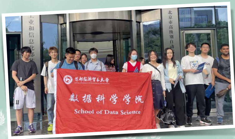
▲ CUEB students visiting a self-driving car company in Beijing.

Learning happened for all of us, teachers, and students. And after the first couple of months there was a definite shift. Things began to feel surprisingly natural and easy. For one, I began to see more similarities, not just differences between U.S. and Chinese classroom cultures. There were eager and hardworking students, students that needed more reassurance and support, and everything in between. And, as I got to know the students on a personal level, I learned about their hopes and dreams, their family and social lives, their hobbies, and other interests.