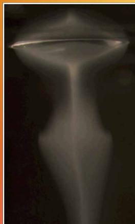
Fig. 2: A “microtornado” comprised of nanoparticulate atmospheric aerosols, and produced by the interaction of vapor-form ammonia and hydrochloric acid.