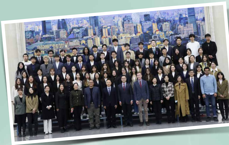
▲ Group photo of students, faculty, and staff from the new joint program in Statistics and Data Science.

One of the biggest surprises I took away from the experience was how many similarities there are between students in the U.S. and in China. Yet there are also many differences in academic culture and expectations. For example, running DATA 363 as a flipped classroom was a new experience for the students. So, the start of the semester challenged us to learn about and adapt to each other's expectations about classroom dynamics, providing many opportunities for discussing and learning from our differences and similarities.